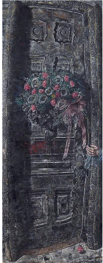
Ivan Albright—American, 1897–1983. That Which I Should Have Done I Did Not Do (The Door) , 1931/41